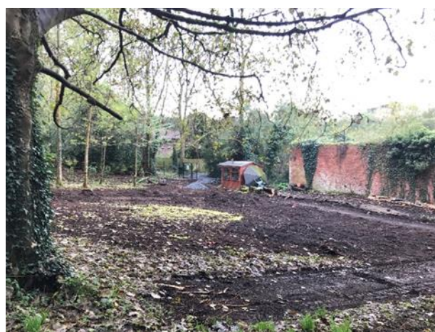
Dunville garden October 22

Since starting the green gyms in August/September 22 they have gone from strength to strength. We have laid paths, cleared many invasive species, improved plant diversity, found many historical items and created a space for the community to spend time, integrate and learn. In these volunteer sessions we have undertaken restoration work and made the site a safe open space, where we are now planting and producing food for the coming season, this will lead into the next phase with more community involvement.