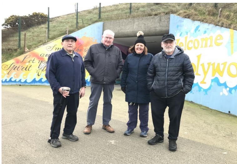
A winter walk along the North Down coastal path