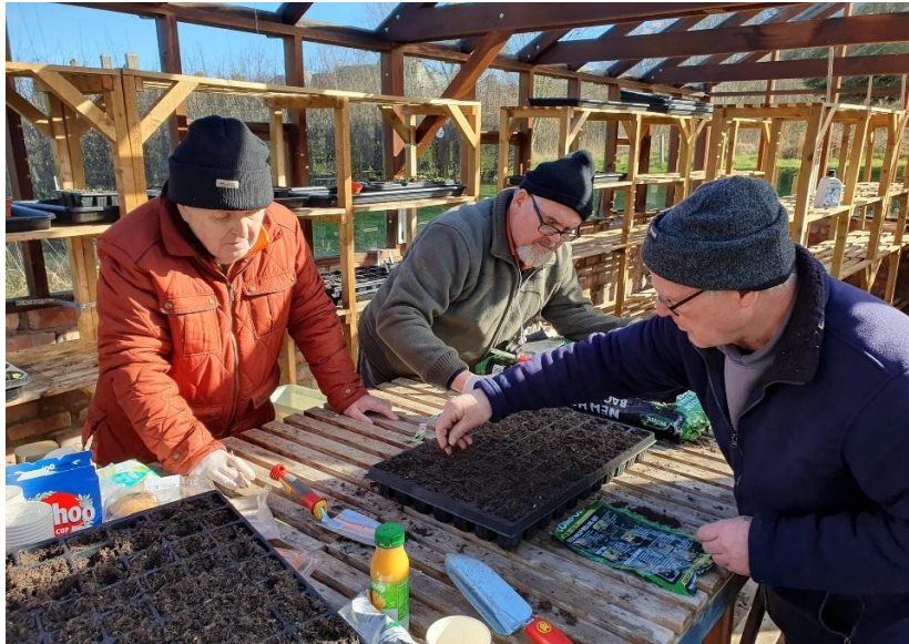
Some members undertaking a horticulture training course with TCV

During 2021/22 we experienced a couple of incidents of vandalism in the Enchanted Garden. This was very upsetting and disheartening to the members who put so much time and effort into making the garden an exciting and safe area for everyone, but especially young children. When our neighbours in Redburn and Loughview learned what had happened they rallied round in support and raised a substantial sum of money to pay for a CCTV system to help protect the Enchanted Garden and make it a safer place. This was followed by a very generous cheque from Redburn Youth Group to help repair the damage and restore the garden. After consultation with parents of children who use the garden, we installed the CCTV. It was really encouraging for the shed members and they were overwhelmed by the community's support for their work.