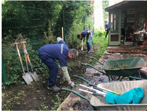
Danske Bank volunteer work party, August 22

We now have a twice weekly, well attended, Green Gym programme; the Green Gym is a scheme which inspires people to improve both physical, mental health and the environment at the same time, giving people the opportunity to tackle physical jobs in the outdoors – improving strength and stamina, boosting practical skills and confidence and benefitting local green spaces. Sessions are run by TCV staff members and a Volunteer Officer who has been trained in first aid and site supervision.