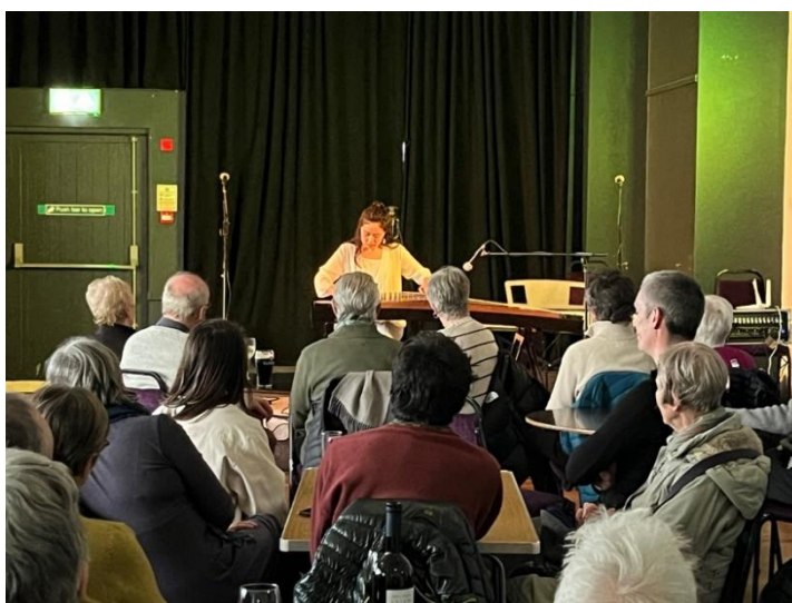
World music concert with Beyond Skin