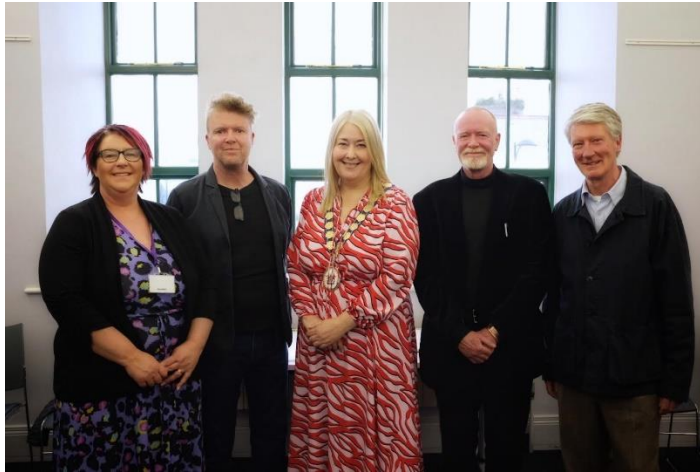
Exhibition launch, Hollywood Library