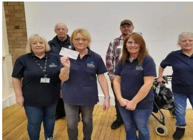
Presentation of a generous cheque from Redburn Youth Group to Hollywood Men's Shed

During 2021/22 we experienced a couple of incidents of vandalism in the Enchanted Garden. This was very upsetting and disheartening to the members who put so much time and effort into making the garden an exciting and safe area for everyone, but especially young children. When our neighbours in Redburn and Loughview learned what had happened they rallied round in support and raised a substantial sum of money to pay for a CCTV system to help protect the Enchanted Garden and make it a safer place. This was followed by a very generous cheque from Redburn Youth Group to help repair the damage and restore the garden. After consultation with parents of children who use the garden, we installed the CCTV. It was really encouraging for the shed members and they were overwhelmed by the community's support for their work.