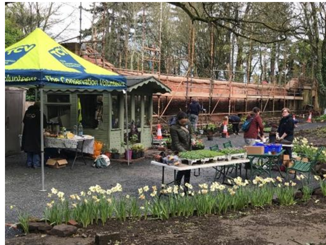
Plant and sow day March 23

The garden is used to host many of our family-friendly events and we are planning several more for groups, schools, and all in the community.