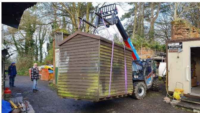
Members showing their expertise in moving a shed in preparation for wall repair

contractors who worked with us in managing what could have been a very disruptive undertaking.